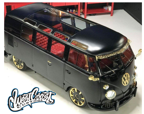
Steampunk VW Bus - West Coast Customs has been using Damplifier Pro since the Pimp My Ride days